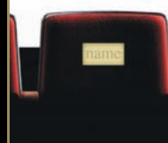
Valerie Alderson, Head of Drama

Seat-back plaque in the studio theatre cost: £100 each size: 100 mm (w) x 50 mm (h)