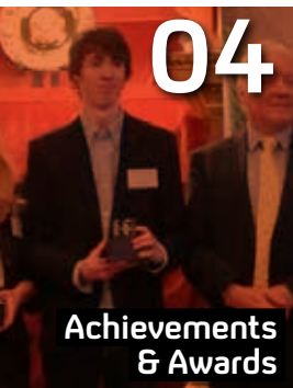
Achievements & Awards