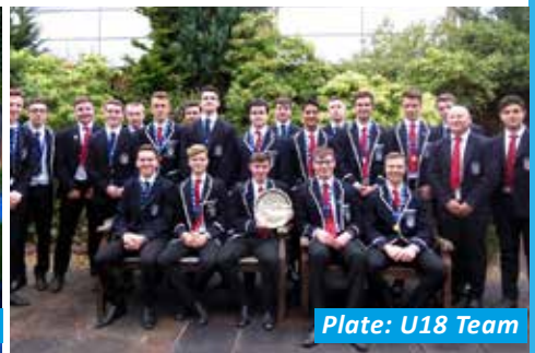
Plate: U18 Team