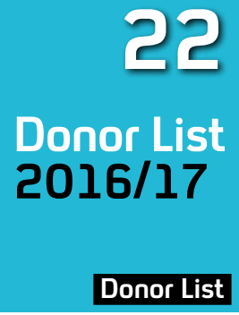
Donor List 2016/17