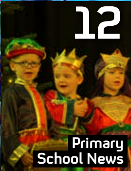
Primary School News