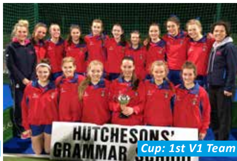
Cup: 1st V1 Team