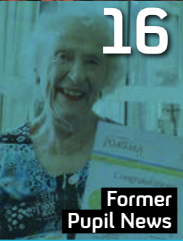
Former Pupil News