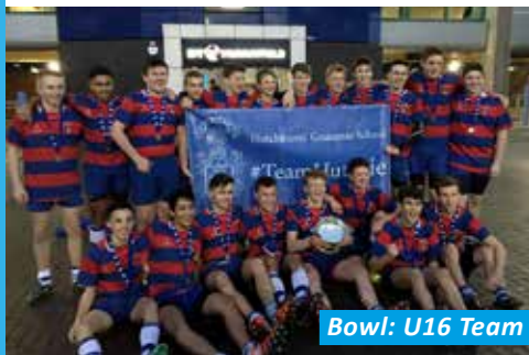
Bowl: U16 Team

The girls were back in action a few days later in the West Indoor Tournament. They finished strong winners of the section after defeating High School (3-1) in the opening match, followed by wins against The Glasgow Academy (2-0) and Lomond (5-0). The team narrowly won against Jordanhill in the semi-final before a very strong Craigholme team beat them in the final.