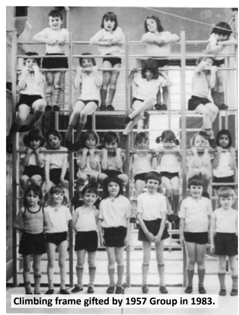
Climbing frame gifted by 1957 Group P. 2a

The School Magazines since 1957 are dotted with thanks from various departments, pupils and teachers for the generosity of the 1957 Group. Hutchesons' today would look like a very different school without the tireless efforts and marvellous donations from the 1957 Group and their many volunteers over the last sixty-two years. All those who contributed to its success should be justifiably proud of all that they achieved from the 'fun' events they organised to the fantastic, much needed, resources that they donated to the school, making a significant contribution to the success of the school.