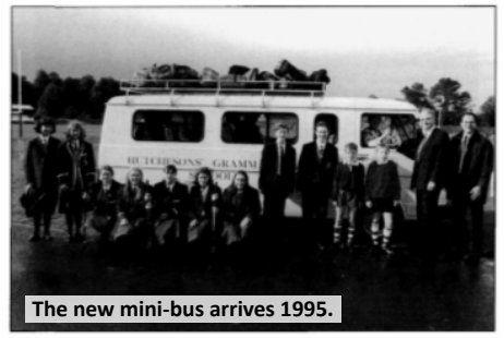
The new mini-bus arrives