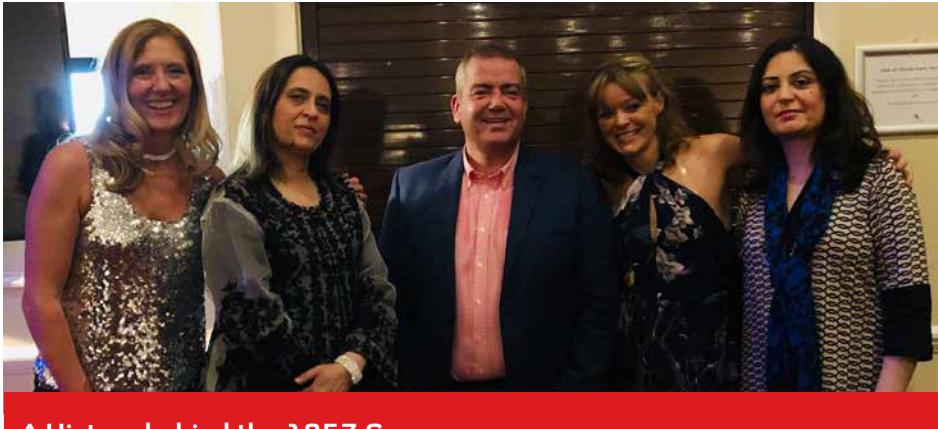
A History behind the 1957 Group